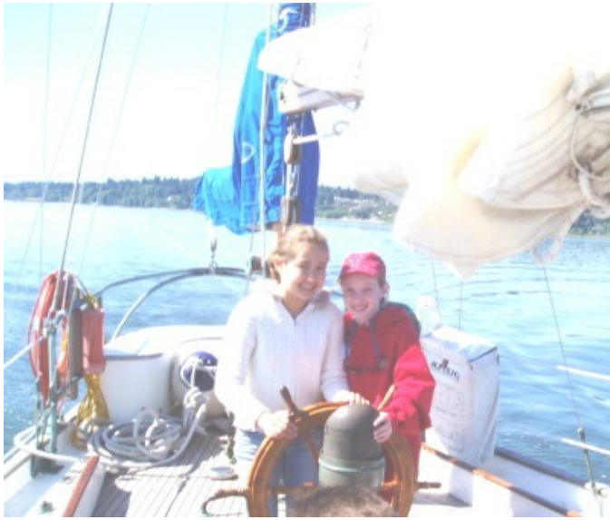
Poseidon group sharing helm duties

Our plans for the remainder of the year and next year include continued charter to Evergreen and expanding our day sails for paid charters and pro bono sails for youth groups.. We are encouraging youth groups interested in Sail/Maritime training, to contact us. If you know of any please give us a call. Come join us. We need volunteers at all levels of involvement from crew to logistics, promotion and other support functions. We need alternate licensed Captains as well.