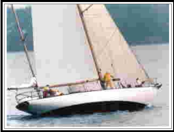
Resolute with a "Bone in her teeth"