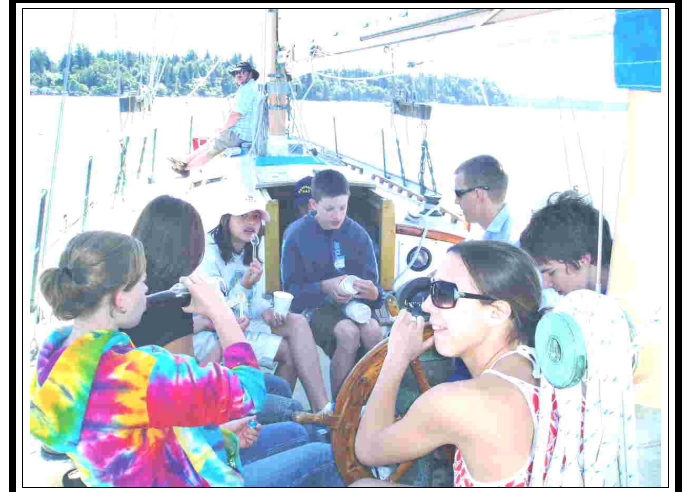
Poseidon Aquatic Club members gather in the cockpit

Last spring, Resolute participated in the Olympia Wooden Boat Festival. She was also chartered for several day trips by different groups. A recent group was the Poseidon Aquatic Club, a swim team from the Olympia area. This club has swimmers in the age group from 9 to 17. The youngsters spent the day on Resolute and seemed to thoroughly enjoy their time on the water. Pictures of that excursion are included here.