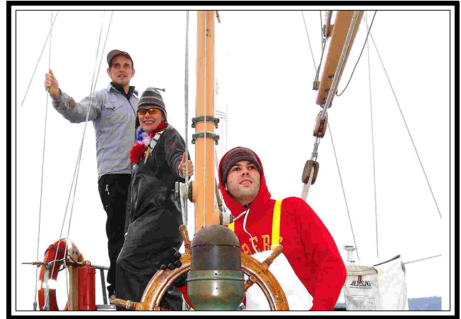
Evergreen Maritime Studies program

So the legend of Resolute continues and more young people experience the challenge of sea and sail aboard one of the great classic yachts of the mid twentieth century